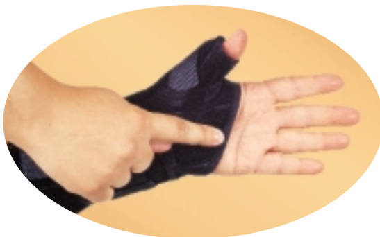
The brace remains below the palmar crease and allows full finger function while securing the thumb