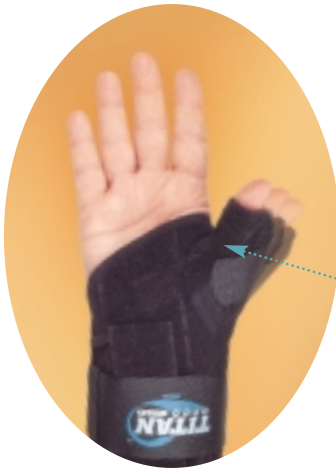
The oblique thumb stay can be bent to allow desired thumb positioning