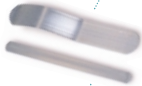
Removable, malleable palmar stay